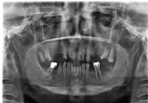
Figure-2: Preoperative panoramic view.

The panoramic radiograph showed multiple carious, broken-down roots and missing teeth along with some restored teeth (Figure 2). The diagnostic casts revealed severe attrition and an uneven occlusal plane. Her problem list comprised advanced tooth wear (compensated), loss of occlusal vertical dimension, moderate oral sub-mucous fibrosis, and missing a substantial number of teeth. After discussing the