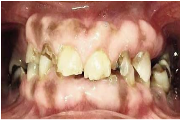
Figure-1: Preoperative clinical presentation.

chewing for more than 15 years. She didn't report any parafunctional habits. On extra oral examination, limited mouth opening of approximately 18mm was recorded. TMJ examination revealed no tenderness, crepitus, or any deviation on opening or closing. The vertical dimension both at rest and in occlusion were measured which revealed a difference of 3-4mm. On intraoral examination, the patient had poor oral hygiene with multiple decayed teeth. Thick white bands were palpable on the bilateral buccal mucosa, revealing moderate OSMF. Generalised tooth wear was observed with multiple occlusal facets along with uneven occlusal plane (Figure 1).