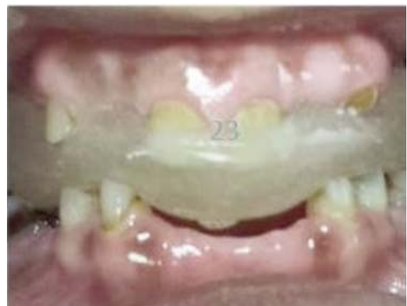
Figure-3: With Michigan splint in position.

The impressions were made along with a bite registration recorded in centric relation. The casts were mounted on a semi-adjustable articulator at an increased vertical dimension of 4mm. A hard clear acrylic, resin-based, tooth-borne occlusal orthotic (modified Michigan splint) was fabricated (Figure 3). The adaptation of the patient to an increased vertical dimension was evaluated in subsequent weekly follow-ups for 10-weeks. The patient reported mild discomfort initially after delivery of the occlusal orthotic for 10 days.