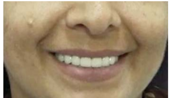
Figure-6: Twelve-month follow-up image.

craze lines or porcelain chipping off at all. SCARE guideline was followed for composing the case report.