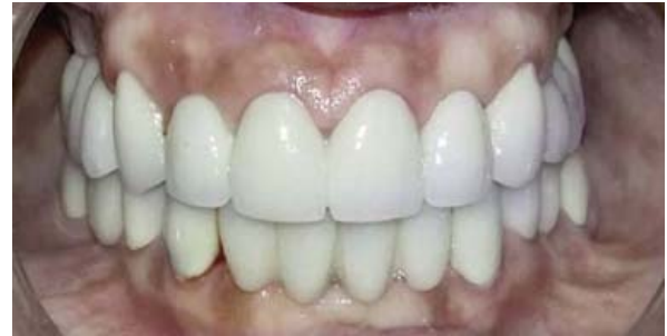
Figure-5: Postoperative clinical image.