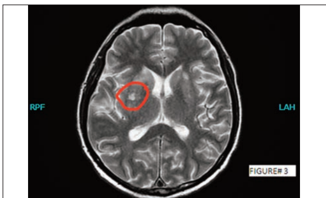
Figure-3: Both basal ganglia demonstrate hyperintense on T2W.

(Figure 2,3). Upon admission his GCS was 12/15 which dropped to 7/15 within a few hours, hence was shifted to the intensive care unit due to his deteriorating condition.