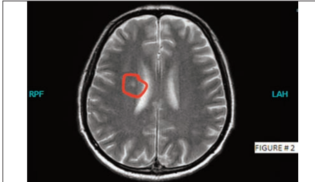
Figure-2: Hyperintense areas seen in right periventricular white matter on T2W.